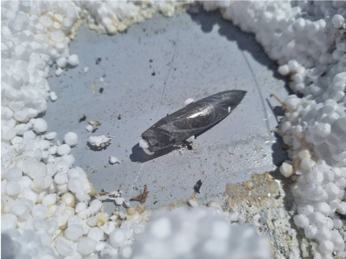
The bullet found on the rooftop in Khallet a-Dabe'.

The military lied. Nasser's investigation proved that.